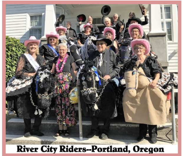
River City Riders--Portland, Oregon

This fabulous dance troupe from Portland, Oregon, has performed for 15 years and has appeared at 12 Nationals and 8 USA Wests. Their steeds are made of plastic barrels cut in half and decorated to look like real horses. The dancers step into them, pull them up, and hook them on.