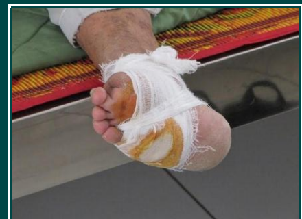
Lepre patient with inferior gauze bandage

Leprosy, a once incurable disease, can be controlled with drugs but many patients live