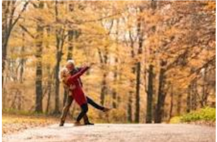
And with it will be fun Fall Dances, topped by our Annual Halloween Costume Dance on October 31st!