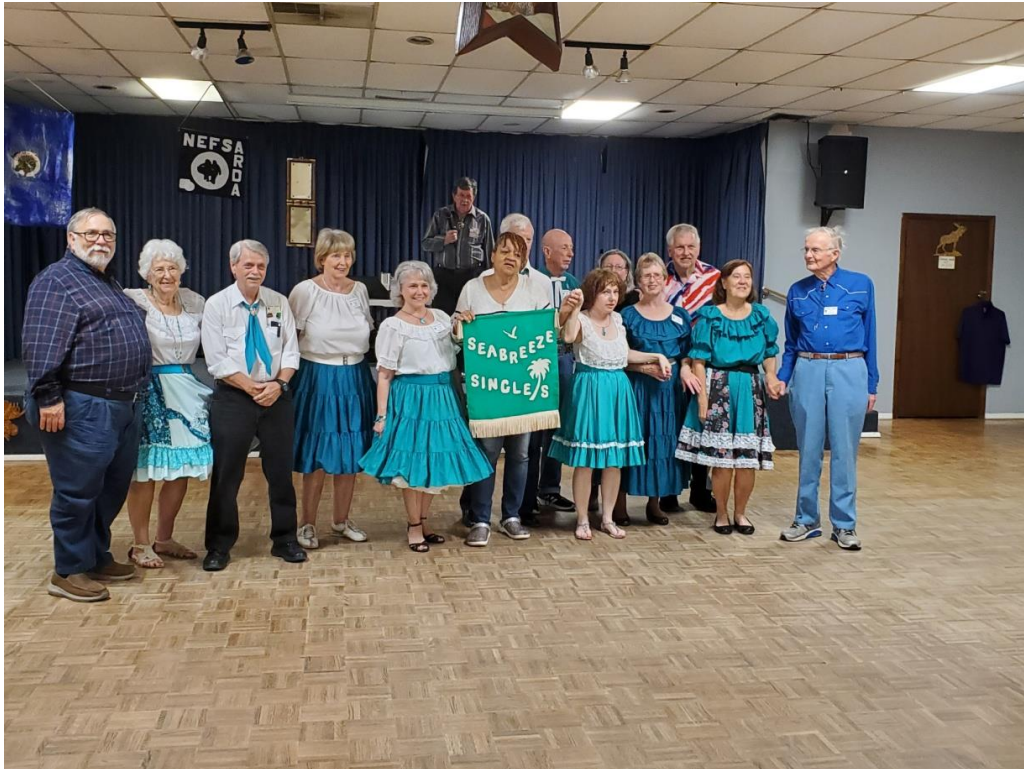
Got our Banner

Further, to celebrate Earth Day, the Seabreeze members scoured their closets and drawers and brought items that they no longer were using. Following the theme of repurpose, reuse, and recycle, the items were placed on a table. Then, the dancers could choose whatever items they wanted. It was like a garage sale without price tags. The items that were not chosen were donated to the Senior Center to extend this theme.