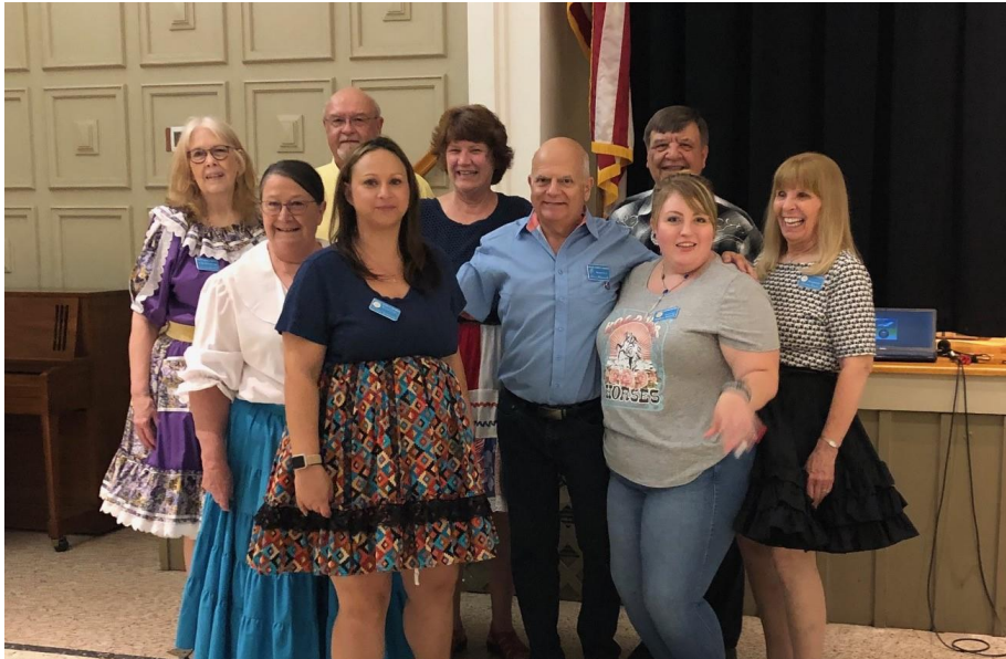
Coastal Georgia Squares