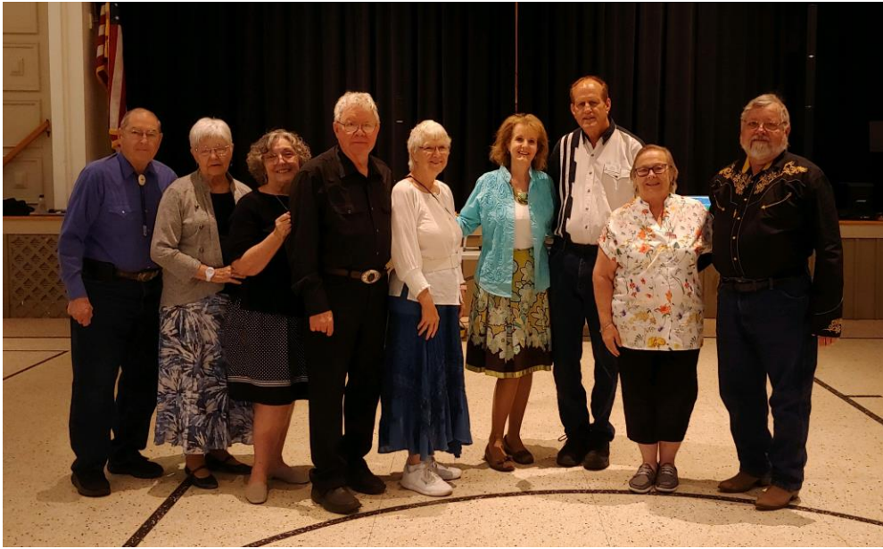
High Springs Dance Club