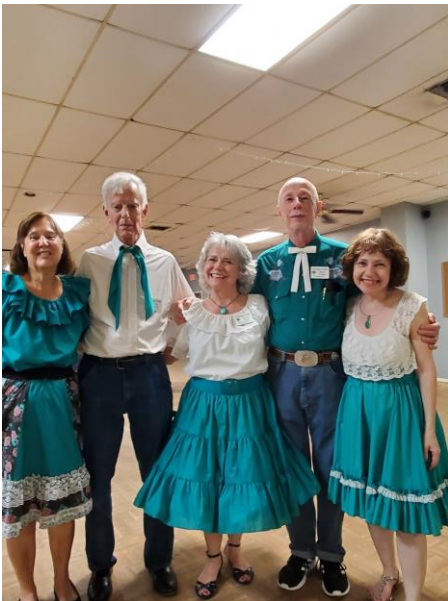
Displaying our Colors

A week following this dance, the club headed to the Moose Promenaders to retrieve our banner. We assembled a group consisting of fourteen club members and three club supporters.