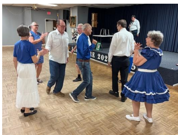
Happy Squares! Above! Check out our Club Colors Blue and White