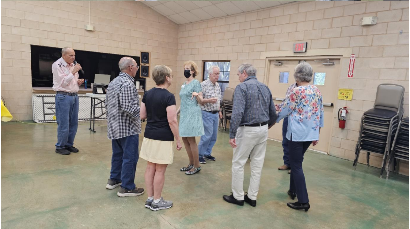
The Grand Squares dances on Tuesday Nights from 6:30-8:30 at Meizon Church at 3411 NW 83rd Street, Gainesville. Bill Cassidy calls multiple levels each evening as we have some