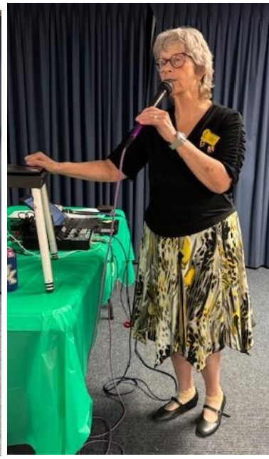
More of the march 20 th Dance