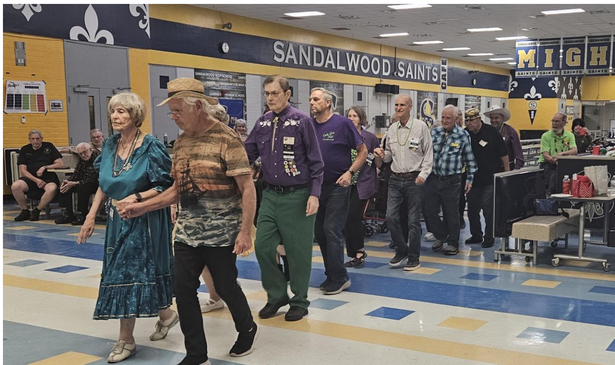
Moose Promanders Retrieving their Banner