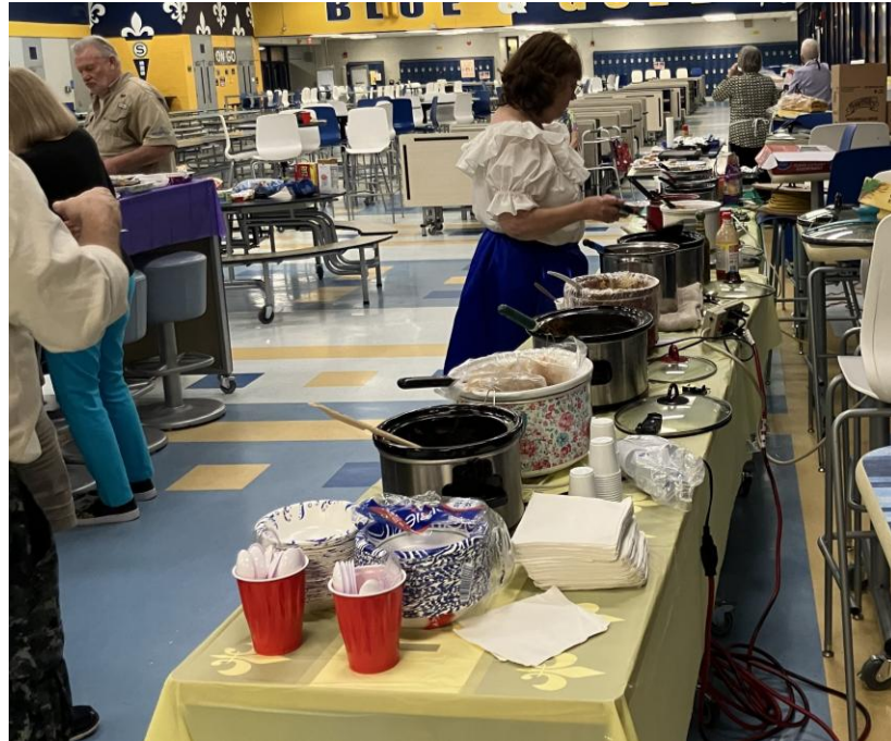
16 bowls of chili to choose from.