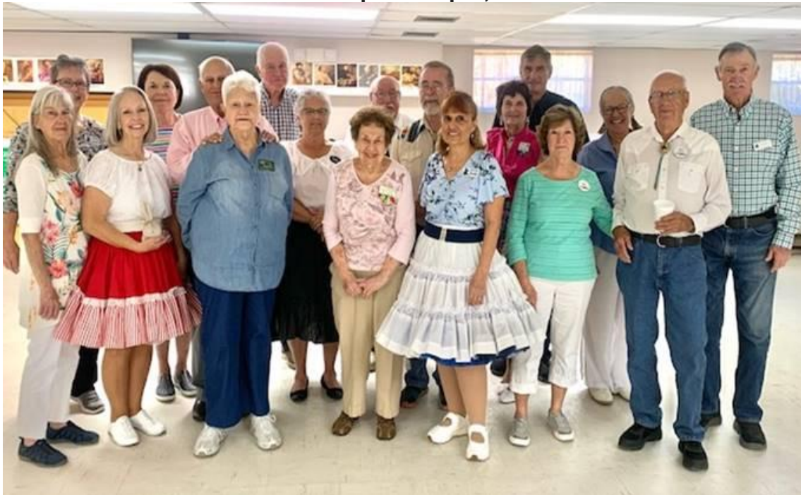
Clover Squares April, 2025

And we do the Main Stream and learning some Plus level of dance