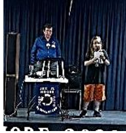
We welcomed some old friends.