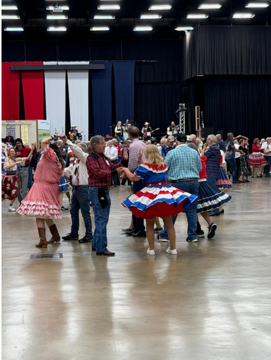
Square Dancing to a live band (The Ghost Riders) really brings up the energy in the room!