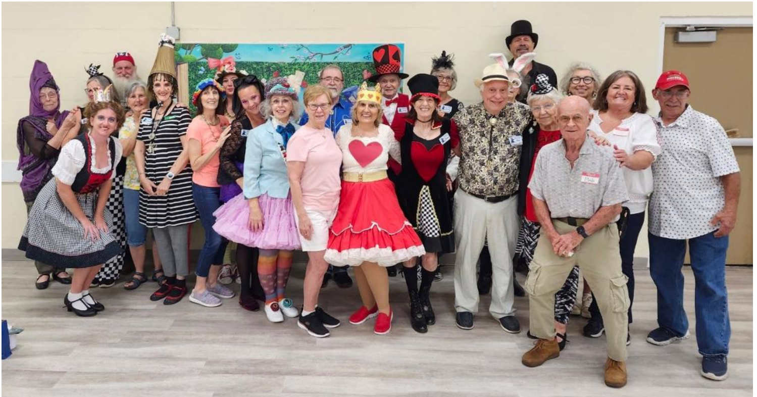
Group photo at our "Mad Hatter" themed night.