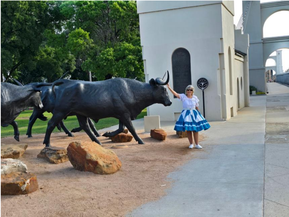
Kathy at the Waco Suspension Bridge over the Brazos River, next to the Waco Convention Center