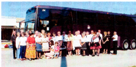
The Mystery gang at our destination.