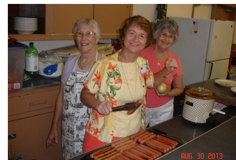
The Dixie Hot Dogs???