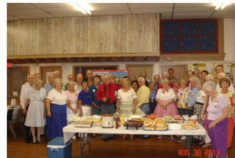
The Dixie Picnicers