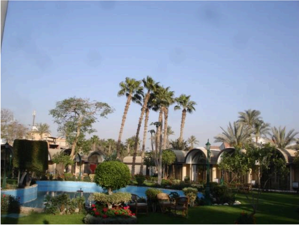
Sunday April 7