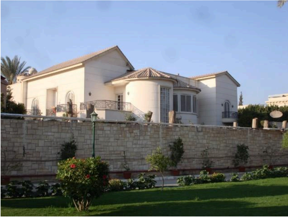
Saturday April 6