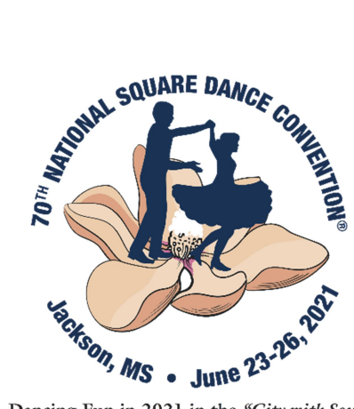
Dancing Fun in 2021 in the "City with Soul"

Held Friday morning at 9:00 on 3<sup>rd</sup> floor in theater. How are conventions awarded to states? Would your state considering putting one on?