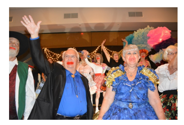
<u>After Parties</u> Another hour of square dancing and round dancing with lots of callers and cuers from 10 - 11. And youth will have a fun hour also.