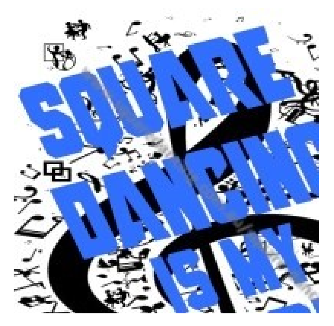
Page 18 of 37