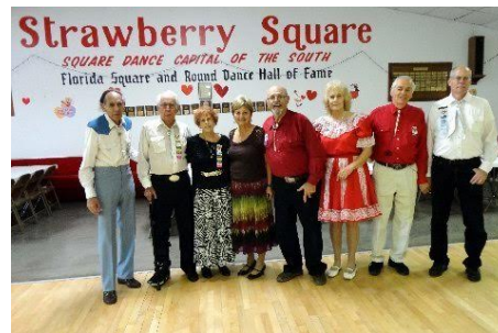
Temple Twirlers, Tampa