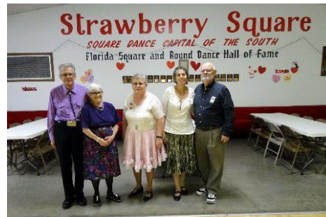
Buttons & Bows of Lakeland