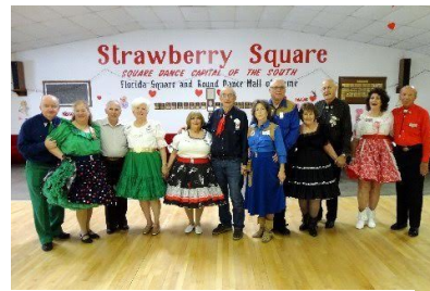
Palace Promenaders, Pinellas Park