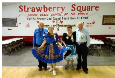
Palace Promenaders, Arcadia

Have you noticed this new phrase being used by some of our dancers in southwest Florida – “Don't worry if you're a single. There'll be a place for you”. It sounds so welcoming to me! So much so, I want to visit these clubs!