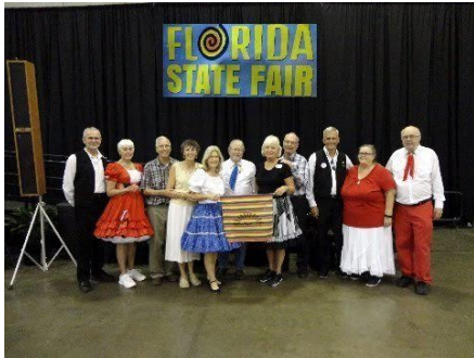
Suncoast Squares, St. Pete