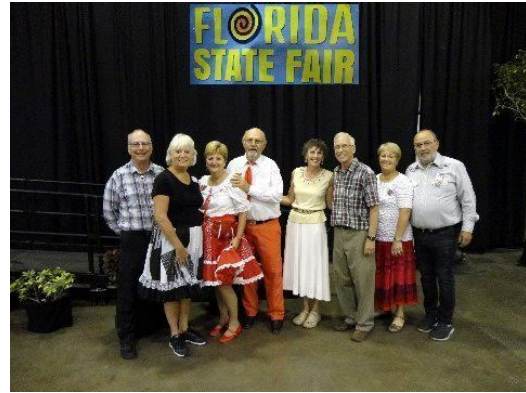
Our Canadian friends