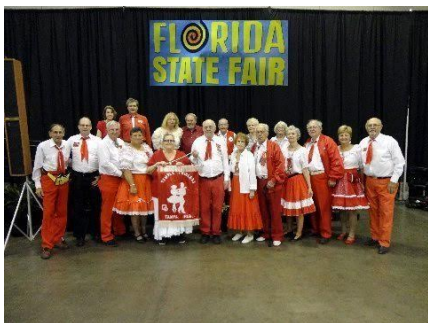
Temple Twirlers, Tampa