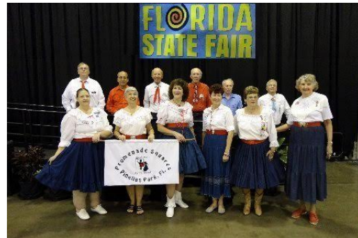
Promenade Squares, Pinellas Park