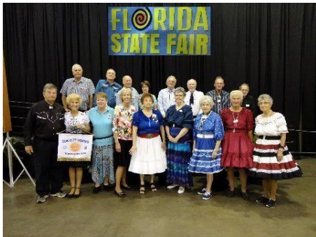
Sun City Swingers, Sun City