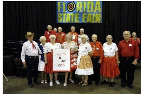
Strawberry Squares, Plant City