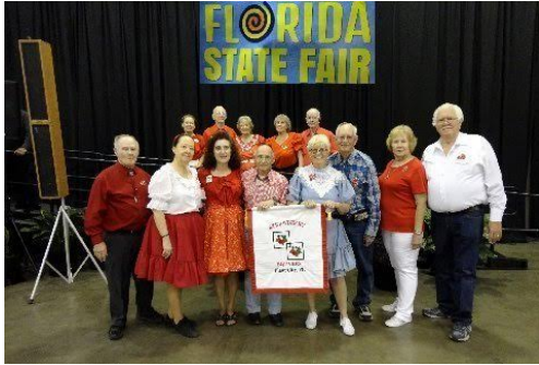
Strawberry Squares, Plant City