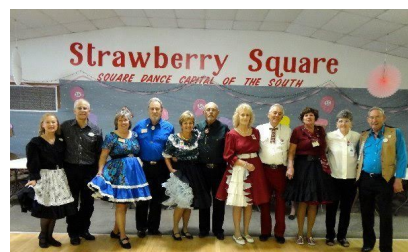
Square Dance Campers Chapter 018 – Strawberry Travelers