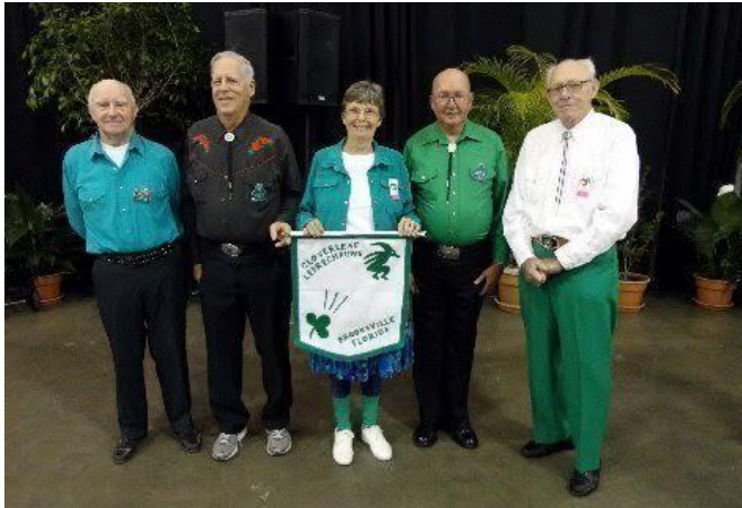
Cloverleaf Leprechauns, Brooksville