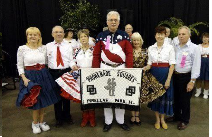
Promenade Squares, Pinellas Park