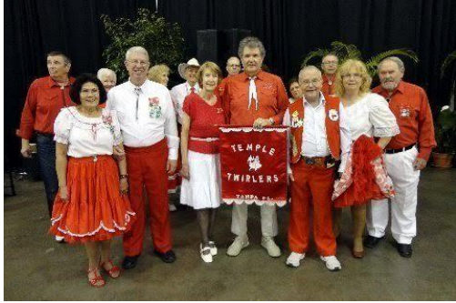
Temple Twirlers, Tampa