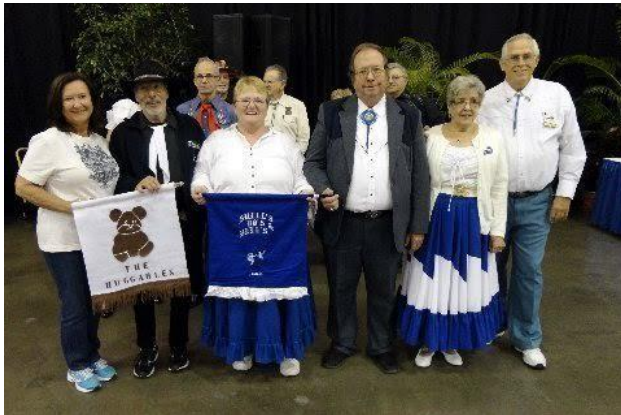
Huggables and Snell's Bo's and Bell's, Pasco County