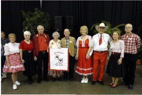
Strawberry Square, Plant City