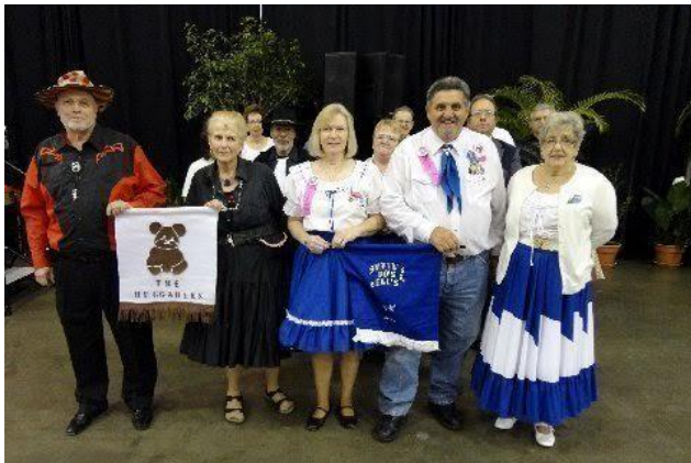
Huggables and Snell's Bo's and Bell's, Pasco County