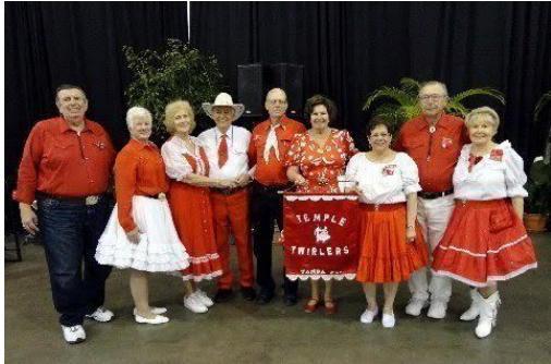
Tempe Twirlers, Tampa