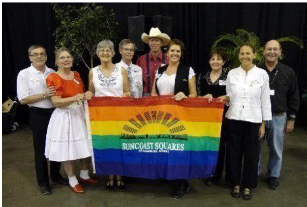
Suncoast Squares, St. Petersburg