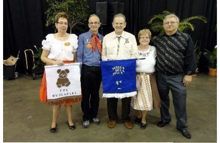
Huggables and Snell's Bo's and Bell's, Pasco County