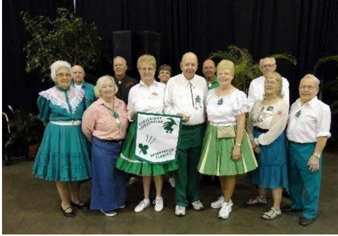
Cloverleaf Leprechauns, Brooksville