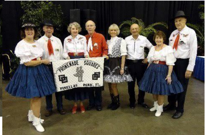
Promenade Squares, Pinellas Park