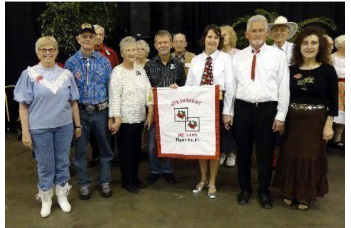
Strawberry Square, Plant City