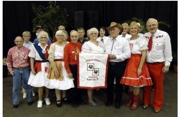
Strawberry Square, Plant City