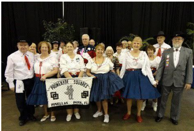
Promenade Squares, Pinellas Park

Our Florida Federation Annual Work Weekend is fast approaching. Everyone is welcome and encouraged to attend this day of meetings so you can become familiar with the workings of our Federation. We will be meeting in Orlando on Saturday, February 27 th , at the Quality Inn at the intersection of Lee Road and I-4. The general meeting starts at 9:00 a.m. There will be reports