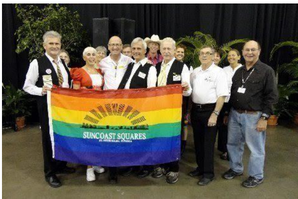
Suncoast Squares, St. Petersburg