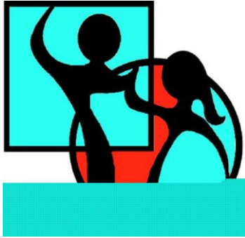
Blue, Green, Turquoise, Red Logo