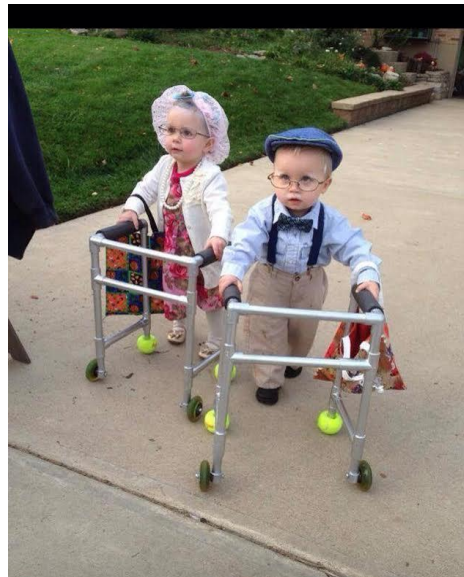
The best Halloween costume in Florida!

Don't forget to go to www.dancergram.com for additional information on West Coast dancers and former dancers!