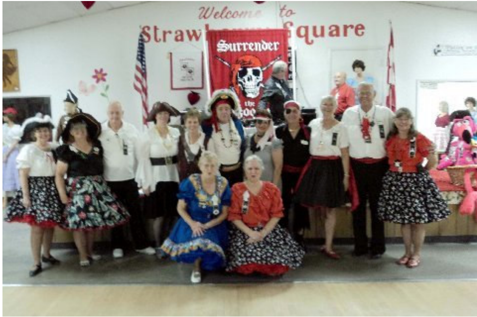
Pirates on the go.