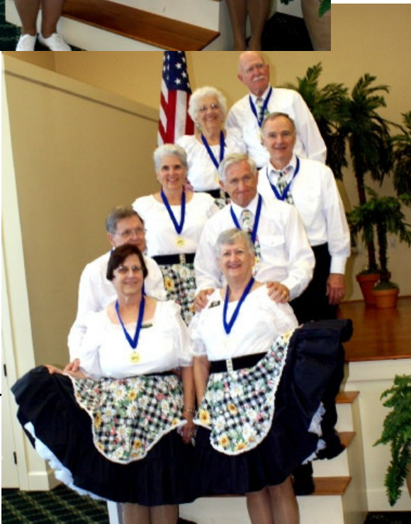
Eight Square – Plus – Gold From The Villages at Lady Lake