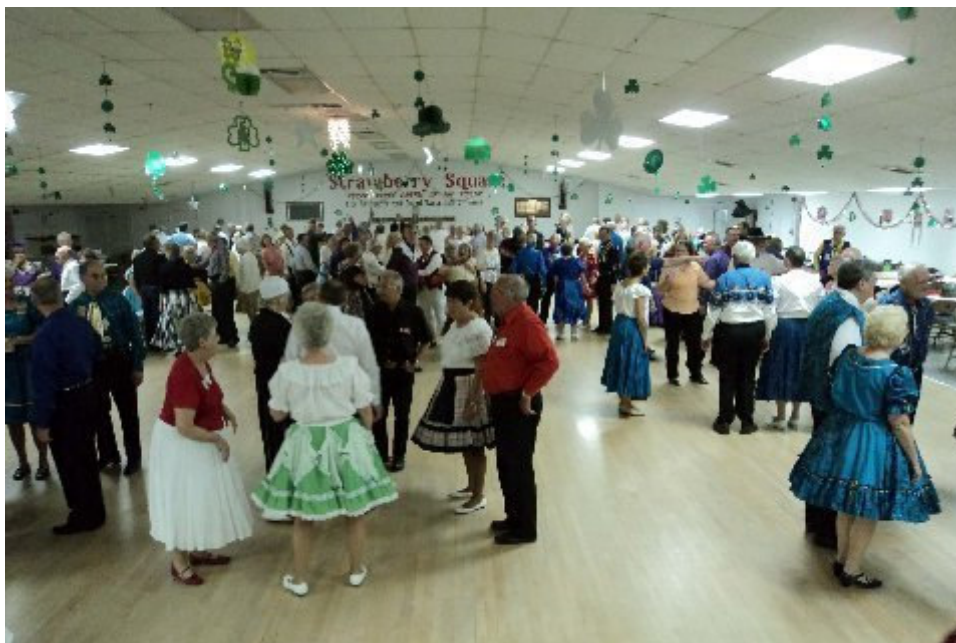
Setting up for the first tip of the night.