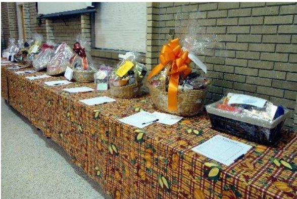
Theme baskets for silent auction