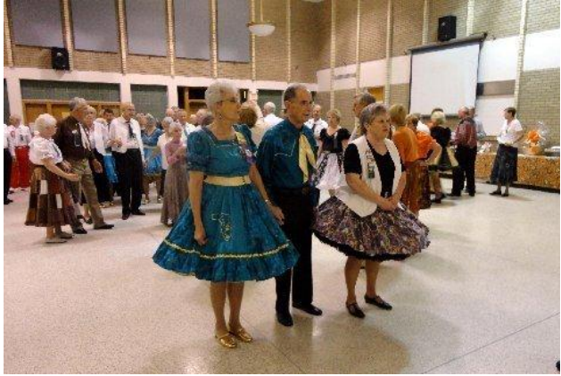
Lining up for the Grand March