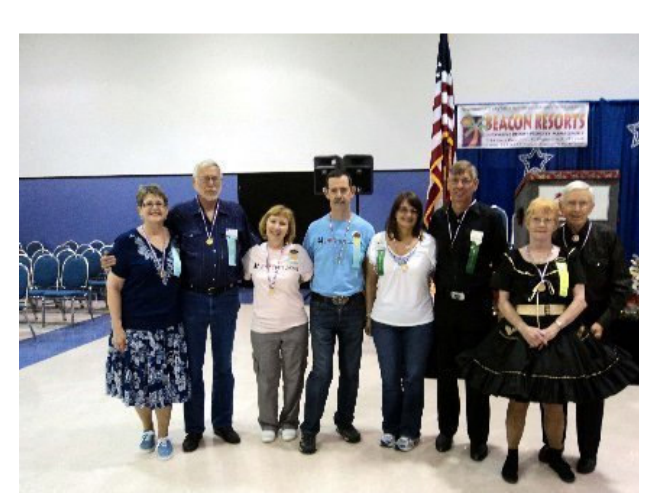
Third place winners