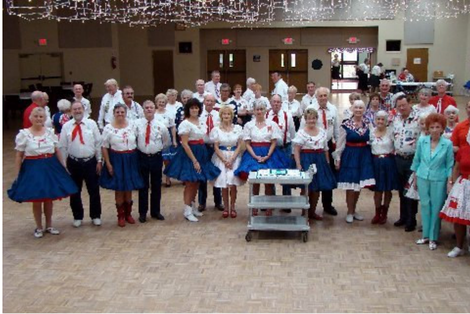
All the dancers in attendance