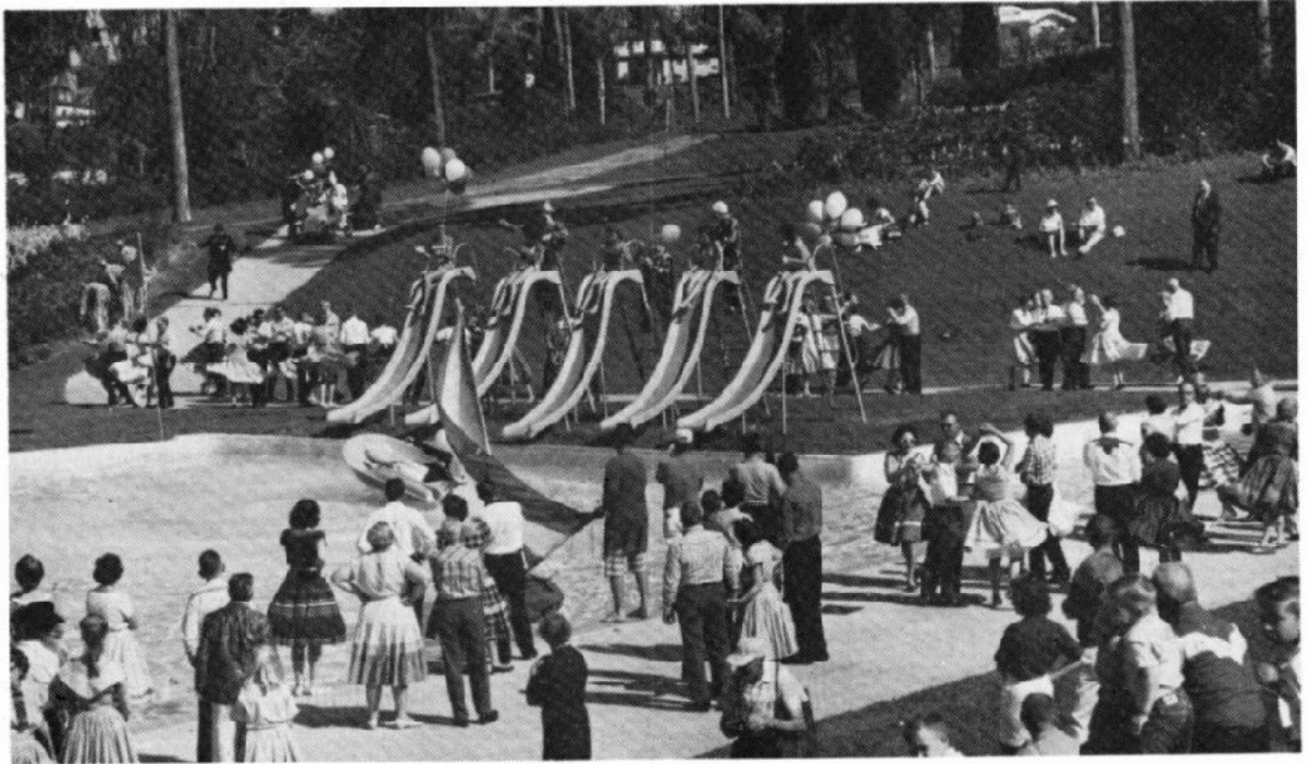
Square dancers from as far away as Sarasota and Melbourne converged on Cypress Gardens January 20 to participate in a mass demonstration of square dancing for the benefit of color cameras of ABC-Paramount. Beginning at 11 o'clock the dancers performed intermittently until 1 p.m., stopped for sandwiches, and resumed again until mid-afternoon. The scene was a kaleidoscope of action, including a London bobby chasing three escaped convicts, a miniature auto with clowns, sailboats and an out-board in the pool, five bathing beauties on the slides, and at the far end of the pool, pretty girls and funny men working off the high dive! Noise of the helicopter bearing the movie cameramen all but drowned out the voice of the caller.