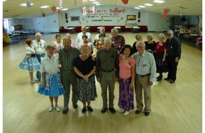
Roland's Temple Twirlers' students (with new dancers in the front)