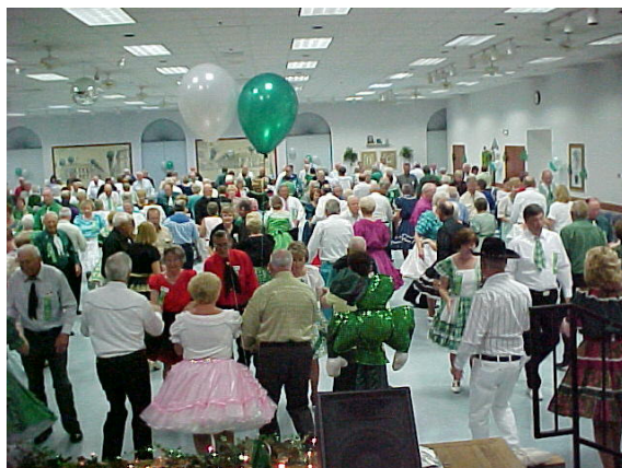
A full dance floor!