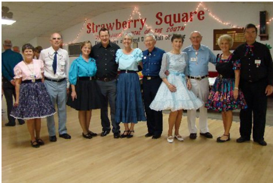
Sun City Swingers, Sun City Center