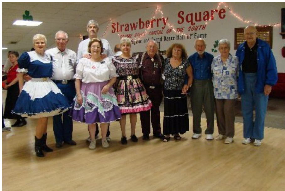
Spinning Wheels, Tampa