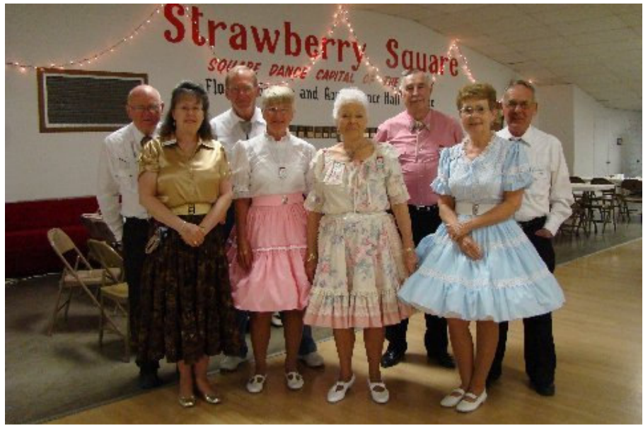
Ding -A- Lings, Riverview