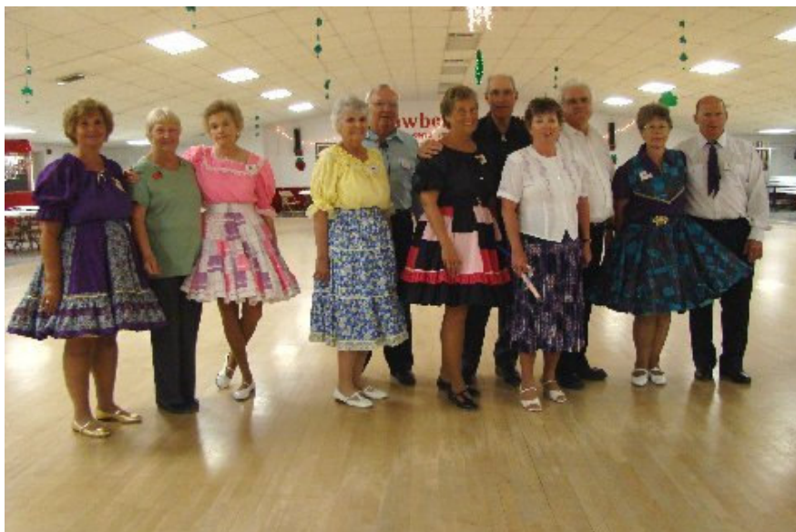
Strawberry Square Members