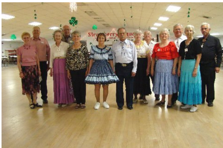
Strawberry Square Members