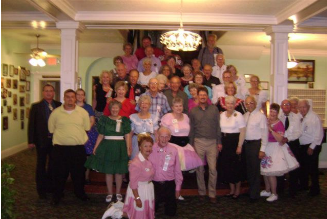
2009 Single - Rama: Our traditional group photo on the staircase at the Kenilworth Lodge.