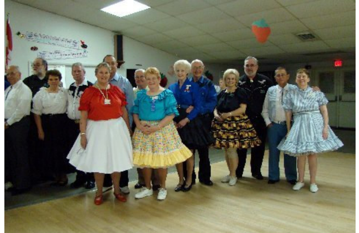
Callers & Cuers attending this dance