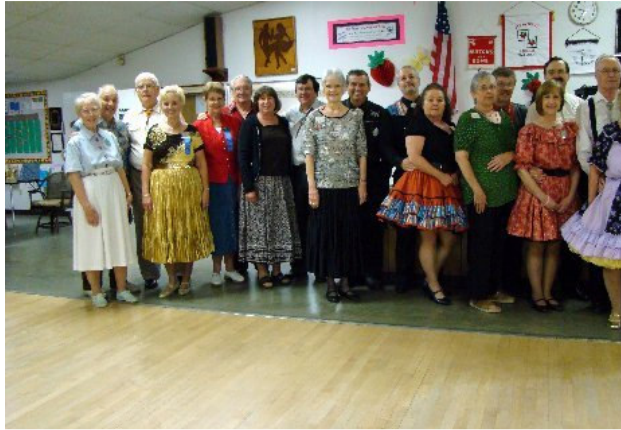
Callers & Cuers attending this dance