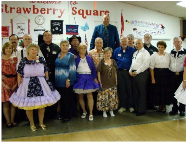
Callers & Cuers attending this dance