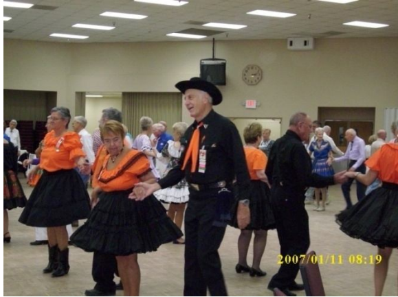
The Good Guys in Black showed up in Orange & Black this time!