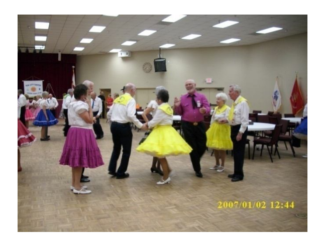
Our West Coast officers know how to dance too!