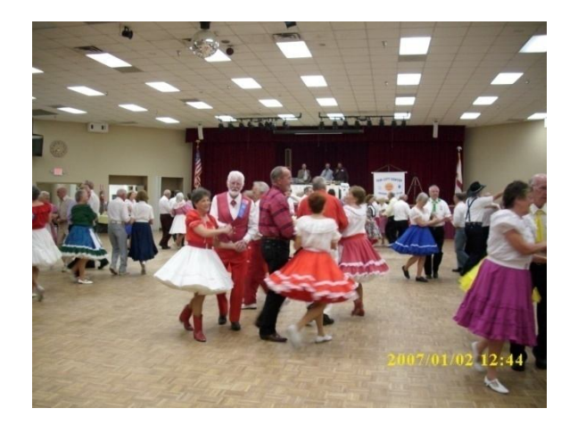
Temple Twirlers struttin' their stuff!