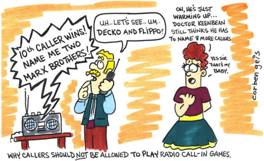
WHY CALLERS SHOULD NOT BE ALLOWED TO PLAY RADIO CALL-IN GAMES.

Reprinted from American Square Dance magazine