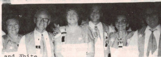
Committee showed up in their Blue and White.