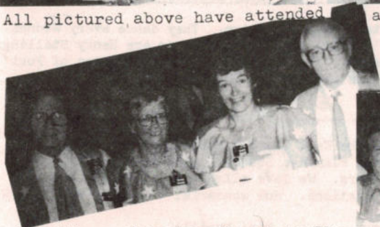
Many of the 1982 State Convention