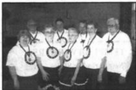
Hampton Promenaders Medal Winners in 2007

Organize Your Square - Get in the Games Dance for Fun - Take Home Gold