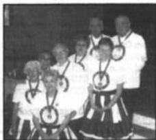
Shufflin Squares Medalists in 2006