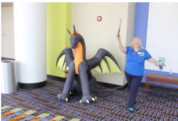
One of the photos from the 2018 FSRD Convention at Daytona Beach, Florida

Although there was a notice in the DANCERgram and reminders to several Clubs, the above is the only information received for Club News