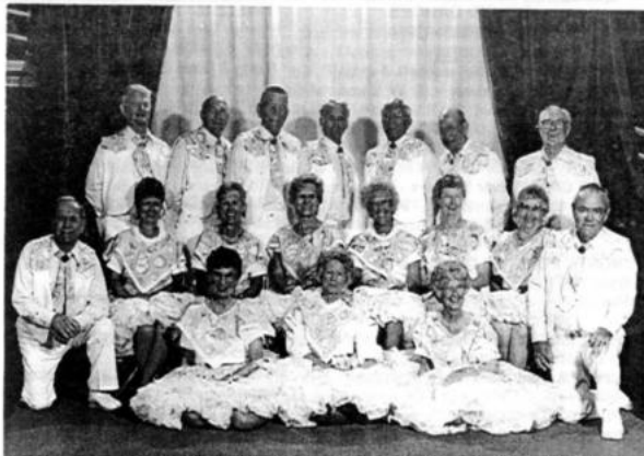
Some of the Demo team promoting the Florida State Convention in 1998. Most of them have traveled 3800 miles since August 1997. They have performed at 25 dances throughout the State and into Georgia and South Carolina.