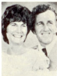
Rounds By: The Lovelaces (Fla.)