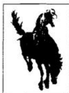
Rodeo June 23