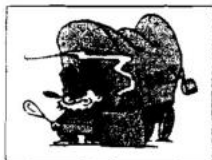
Bar-B-Que June 23