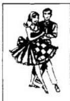
Fashion Show June 26