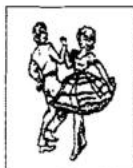
Colorado - Home of Modern Western Square Dancing

Denver, Colorado June 23 - 26, 2004 National Western Complex Exit 275B off I-70