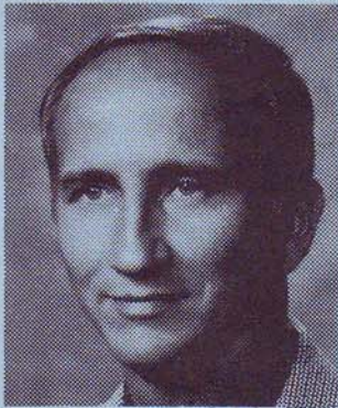
Lynn Haven, Florida

Dances At The RANCH HOUSE 1202 W. 19th Street PANAMA CITY, FLORIDA Phone: (904) 769-8792