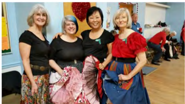
The Ladies were all dressed for Sweet Heart Swing!