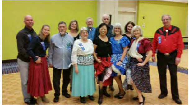
Ribbons at the State Convention and Yes a Sling!