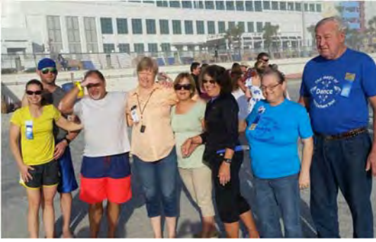
Dancing on the Beach at Daytona with new friends from across the state