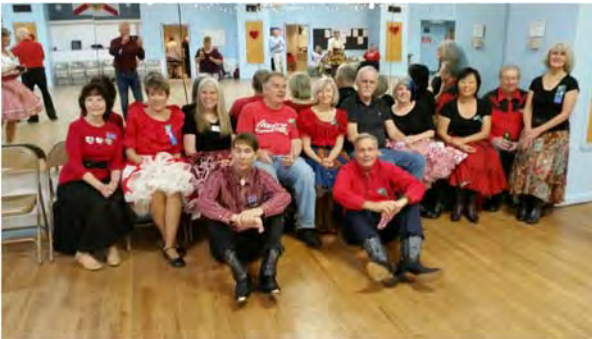
Red and Black was the theme for the Sweet Heart Swing! Many from Agape Squares supported the event at Pasarda Hall in Ft Walton Beach.