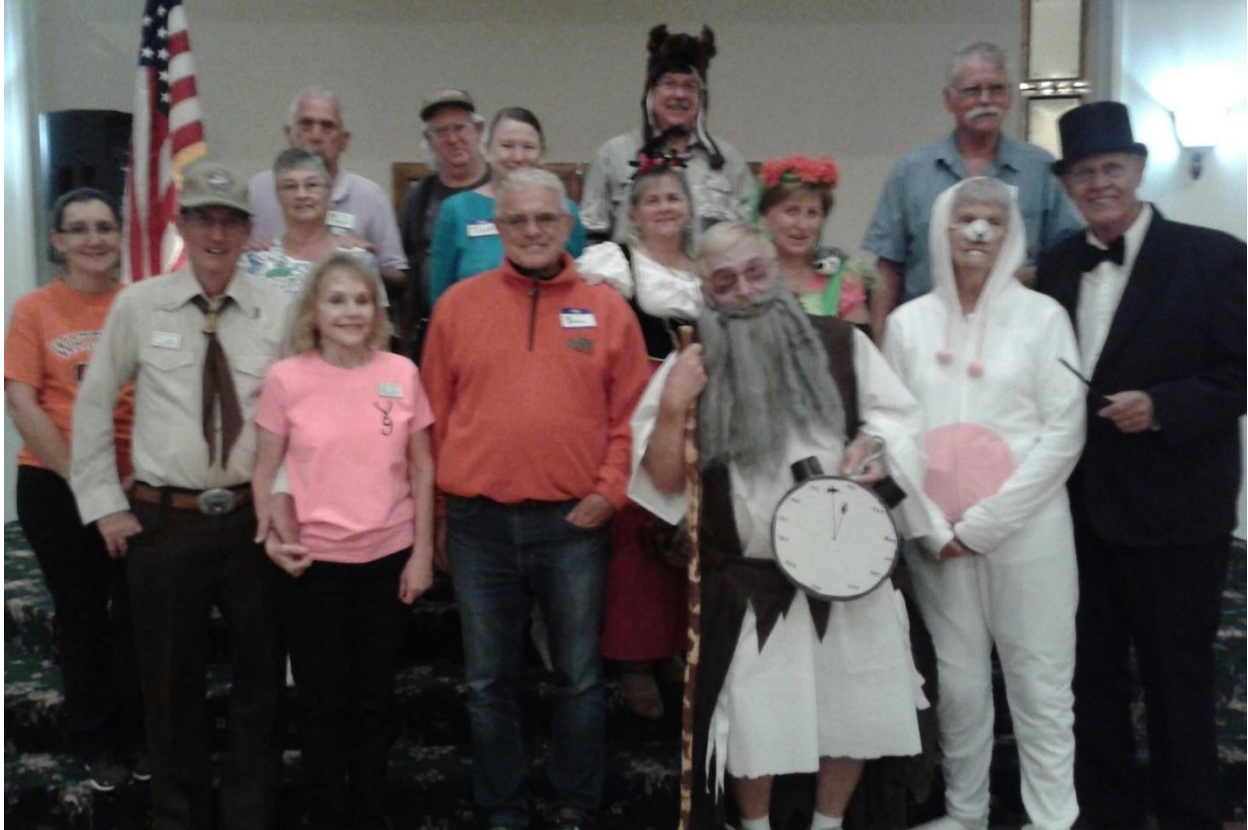
Clover Squares with many in Halloween Costumes