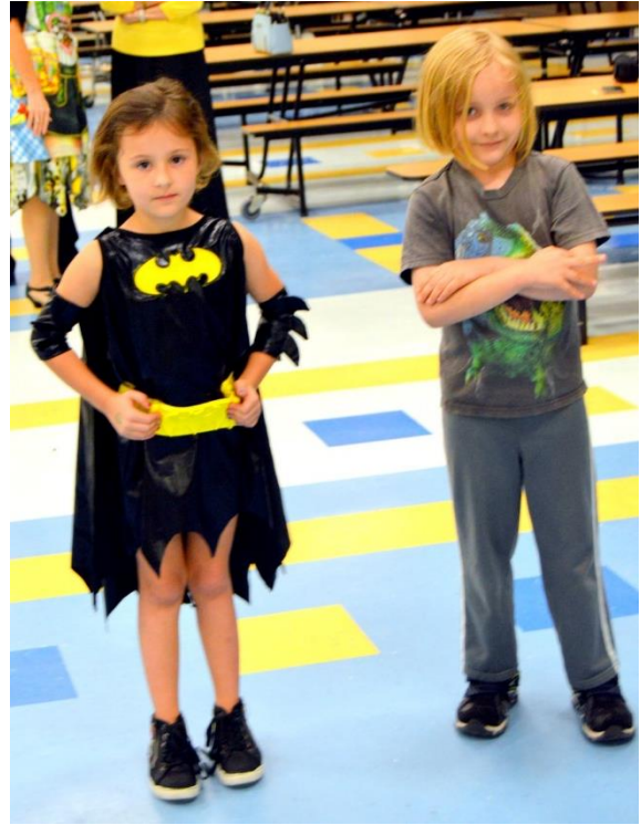
Octoberfest Dance at the Rollaways on October 24th