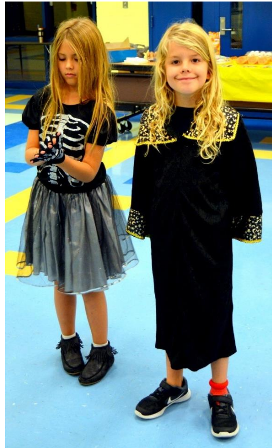
Young Square Dancers