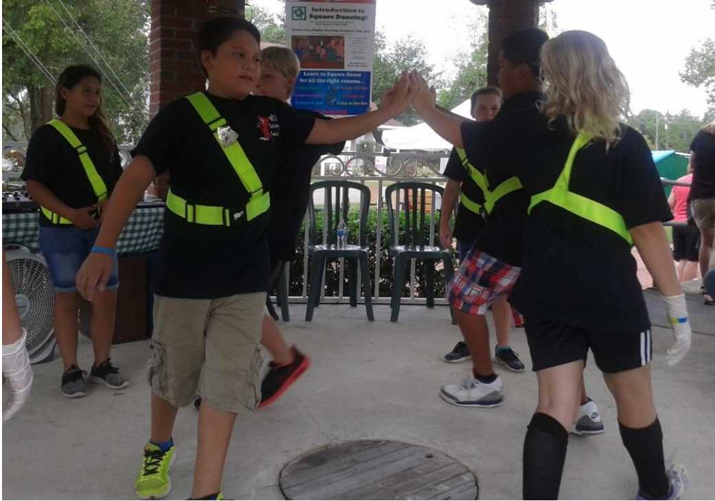
Safety Patrol Members Learning to Dance