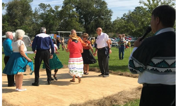
Seabreeze & Moose Promenaders dancers at the Fall Festival at the Holiday Hill Baptist Church