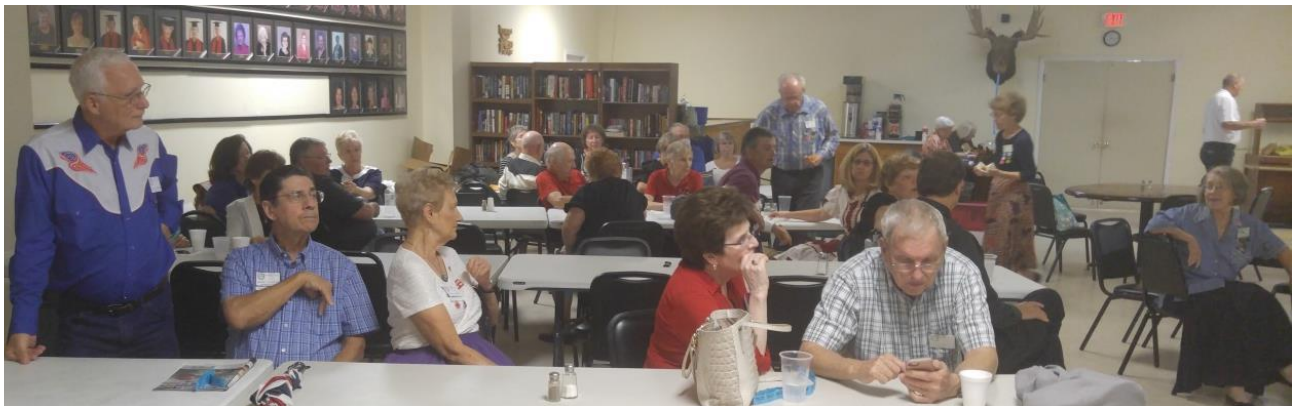
Scene from an October Moose Promenader Meeting

Even though the holidays are coming up and everyone gets so busy...please remember to keep dancing. It's a great way to work off those holiday goodies... and speaking of holiday goodies, please pencil in December 21st on your calendar for our annual Christmas and pot luck dinner dance. Festivities will begin at 6:00 pm. We will be having a Valentine Dance on February 8th, and we will be hosting the annual President's Ball on February 15th.