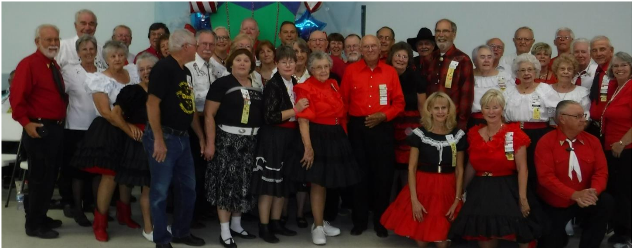
Some of the Square Dance Campers