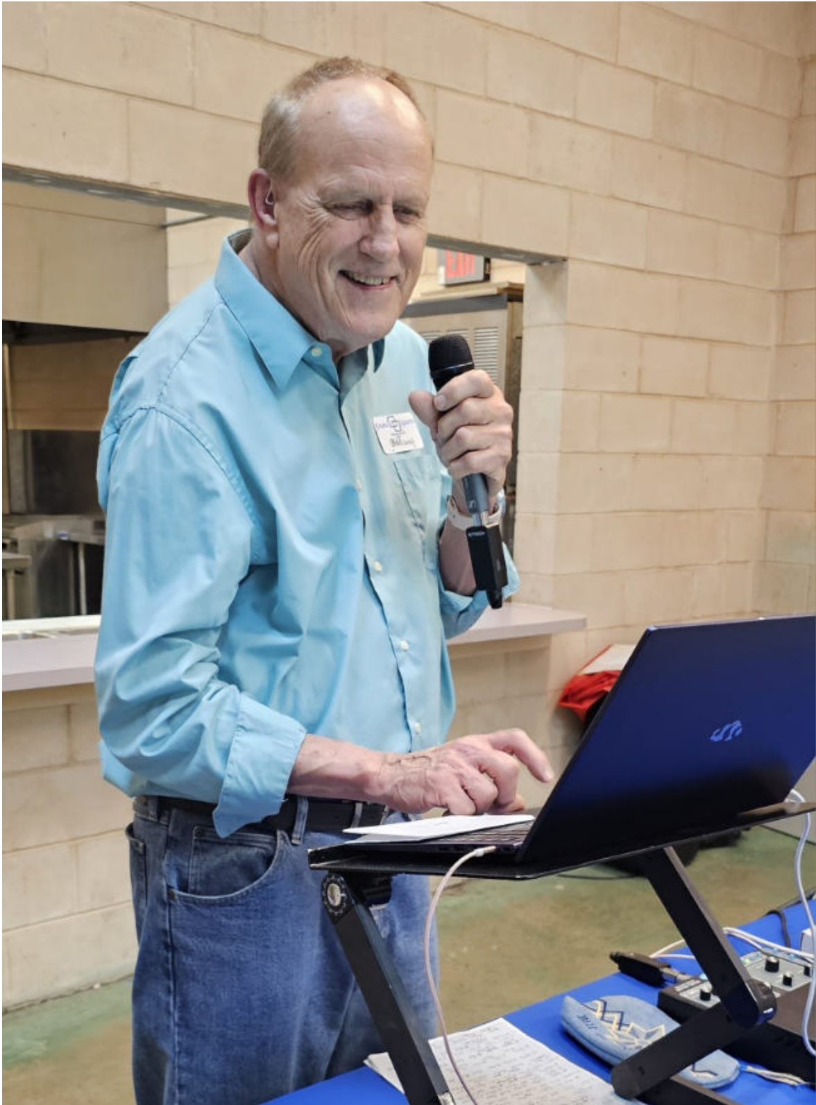
Finishing up another great night at the Grand Squares – MERCY!!