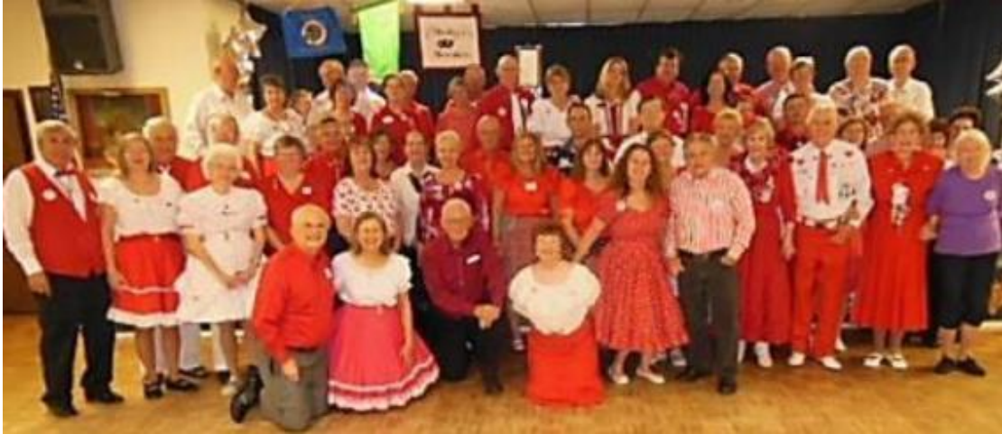
Moose Valentine's Dance. Do you see the Seabreeze Singles banner and the Mandarin Marauders banner above our heads? Both banners were stolen from us that night. Thanks for joining us!