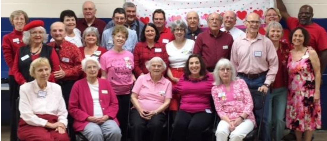
Grand Squares had a wonderful time at their Valentine's Day dance!