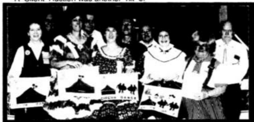
Attendance Banner winners!

THANKS to everyone who supported the dance in any way. The Silver Fox Squares are to be commended for the sponsorship of this dance which benefits such a great Charity!