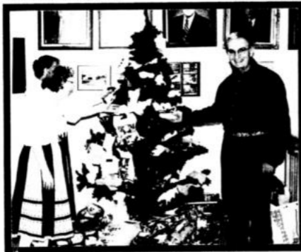
Mandarin Marauders' Christmas "Sock" Tree. Every year they collect socks to donate to the Sulzbacher Center For The Homeless !

We invite you to come and dance with us any Thursday at the First Christian Church at 11924 San Jose Boulevard (Mandarin), Jacksonville, Florida 32223.