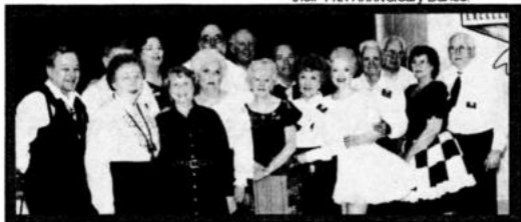
Club members attending their 11th Anniversary Dance!