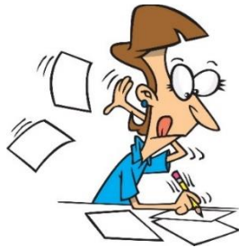
Jim at Work

We are trying something new with this issue. We are including videos of selected events. These videos often show much more than a simple picture. You will find our first included videos under Club News – Moose Promenaders. Just click on the link and the video should appear. Please send us your videos so that we can include them in future issues of the Grapevine.