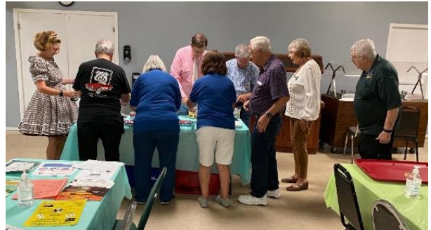
This time for ice cream at our ice cream social.