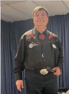
Square dancers can make a square and a line.