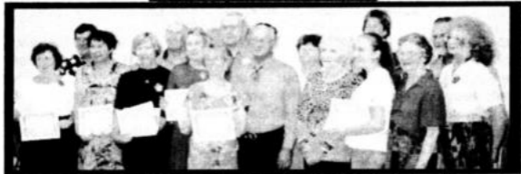
First Coast Rounds graduates of the "Cha Cha - Rhumba class and the full three segments of the Rounds classes!