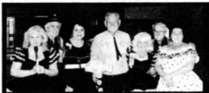
New Officers take over!