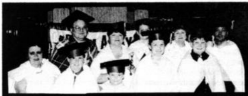
Rollaways latest class graduates!