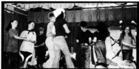
The performance of the children was superb!