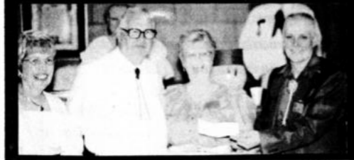
Graduation Check Presentation