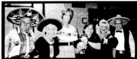
The "Rollies" at their Quatro de Mayo dance!