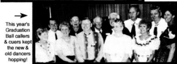
→ This year's Graduation Ball callers & cuers kept the new & old dancers hopping!

If the metric system ever did take over, we'd have to change our thinking to the following: