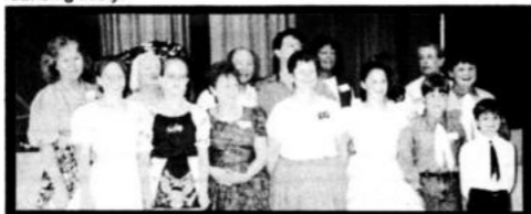
New students attending the 2004 Graduation Ball!