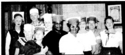
2004 Class Graduates!

Don't forget to Keep Smiling and Keep Dancing!