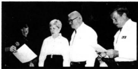
Letters Of Appreciation for a job well done!