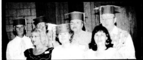
2004 Class Graduates!