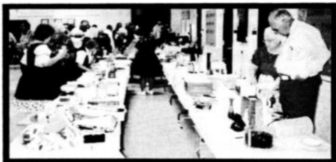
The Silent Auction helped raise the donation tally while the dancers got what they wanted!