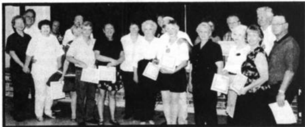
First Coast Rounds "Waltz" lesson graduates!