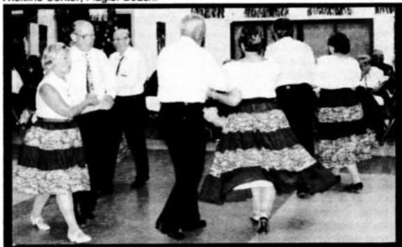
Members of the Flagler Ocean Waves turned out for the Fifth Saturday Dance on May 31st.