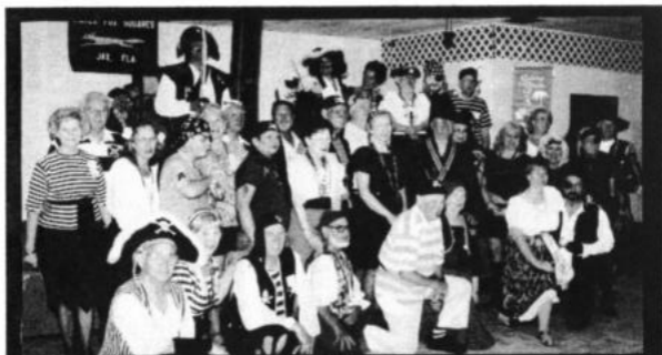
All of the "Pirates" managed to quit their "pillaging" for a few moments of "togetherness"!

Plus class is in full swing so if you wish to brush up on your plus skills come join us on Thursday evenings at the Moose Lodge on Collins Road. Class is at 7.00 PM and club starts dancing at 8.30 PM with Art Wilson calling.