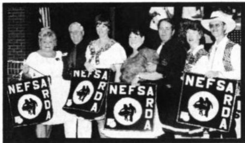
Attendance Banner winners represent Seabreeze Singles, First Coast Rounds, Mandarin Marauders and Yellow Rocks Plus.