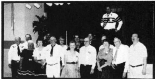
Recent graduates at this years Graduation Ball sponsored by the Gateway Callers Association!

Thanks to all the callers for their continued dedication to the promotion of square dancing!