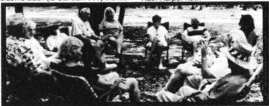
The Rollaways club at their picnic!