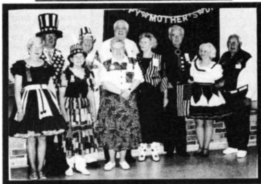
The NEFSRDA Board on one of their several trips to promote the Red, White and Blue Fifth Saturday Dance.