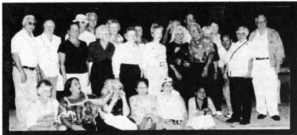
The Rollaways and friends at the St. Augustine "Ghost Tour"!