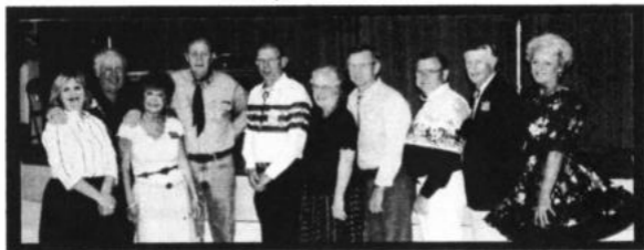
Gateway callers supporting the new graduates!